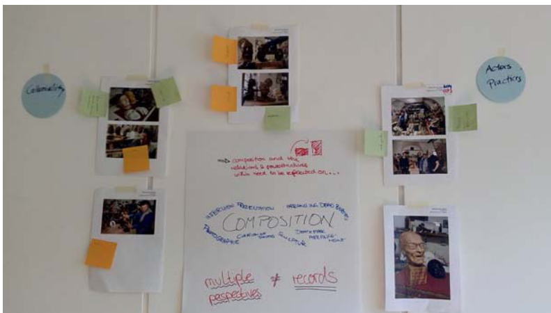
Working boards from Workshops 2 and 4