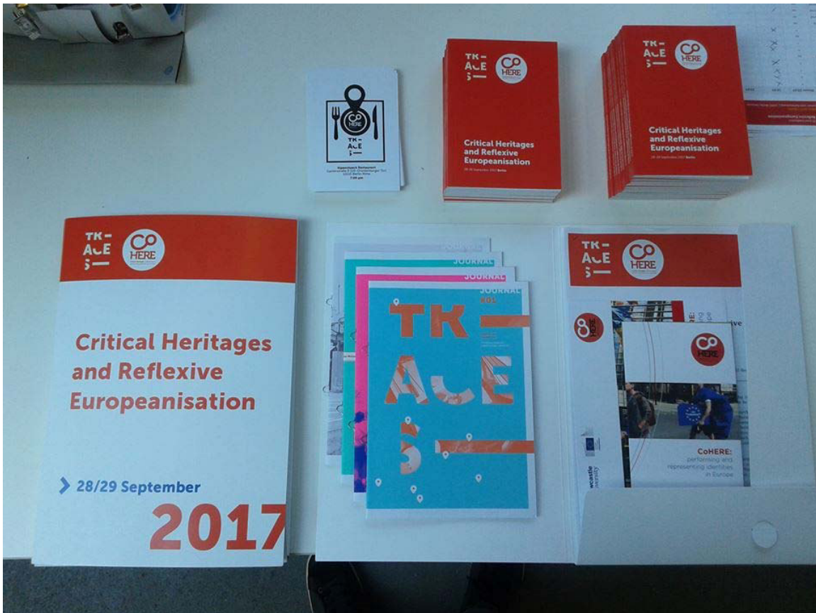
The preparatory material of the Conference "Critical Heritages and Reflexive Europeanisation"

As the TRACES public meeting was organised in form of a two-day international conference promoted in partnership with CoHERE and TRACES, a call for contributions was launched within the two consortiums, in order to gather emerging and established scholars from the two research programmes to discuss European heritage practices and narratives. Drawing on the two projects' research activities and preliminary findings, the contributions selected through peer review were included into three cross-thematic panels ("Neglected Heritages", "Performing heritage(s)" and "Heritage and Crisis"), which formed the very structure of the conference. Each speaker had to prepare a 15 min. multimedia presentation and to participate in a 15 min. Q&A Session.