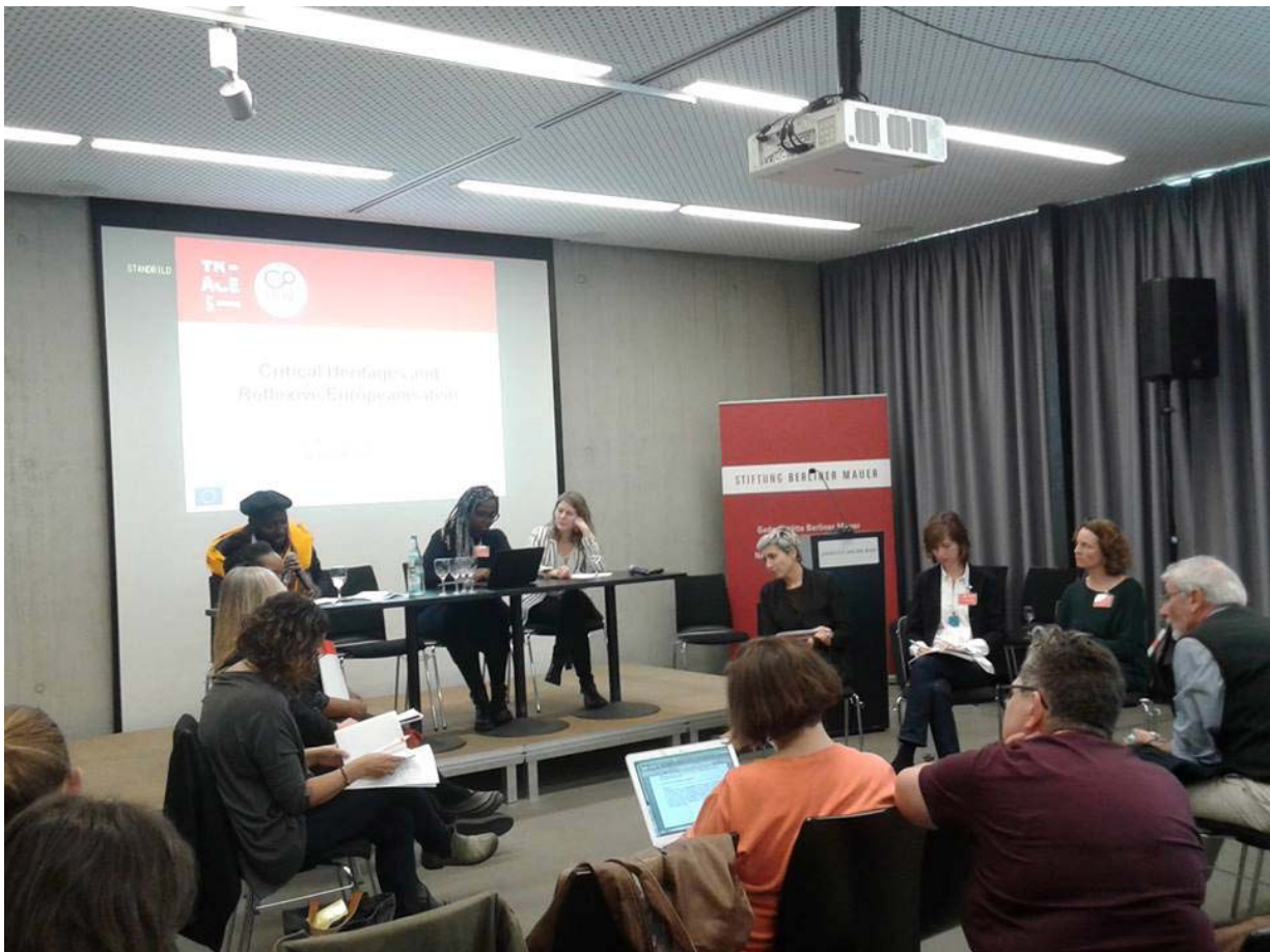
The roundtable at the Conference "Critical Heritages and Reflexive Europeanisation"